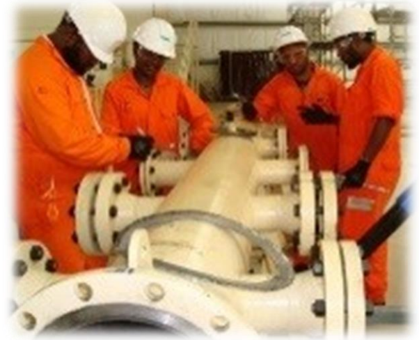
Kumul Petroleum and ExxonMobil Trainees